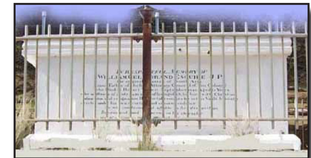
Signage provided by South Arm Peninsula Residents Association. Site conservation work carried out by South Arm & Opossum Bay Coastcare Groups.

The vault can be viewed on Arm End with interpretive signage.