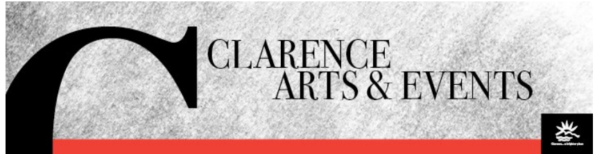
EXHIBIT / PERFORM / PRESENT: 2018 PROGRAMS OPEN

Andre Morrisby 03 6273 1577 www.parrair.com.au