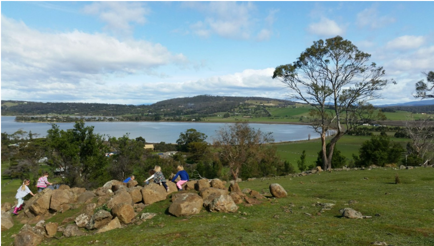
A STUNNING PENINSULA VIEW—SENT IN BY CREMORNE PLAYGROUP.