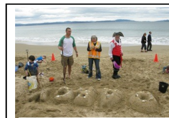
Volunteers and others at 'Wrecked in Cremorne'

Enquires: Rae 6239 9342 or any Committee Member (Page 2)