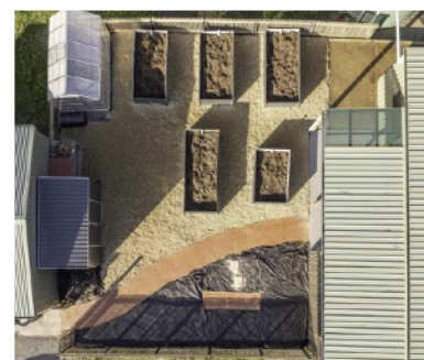
Drone view of garden development