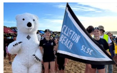
Junior State Titles